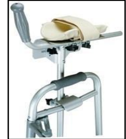
FOREARM ATTACHMENT ITEM# 8000

1" FRAME – 4082 SERIES WEIGHT CAPACITY 330 LBS.